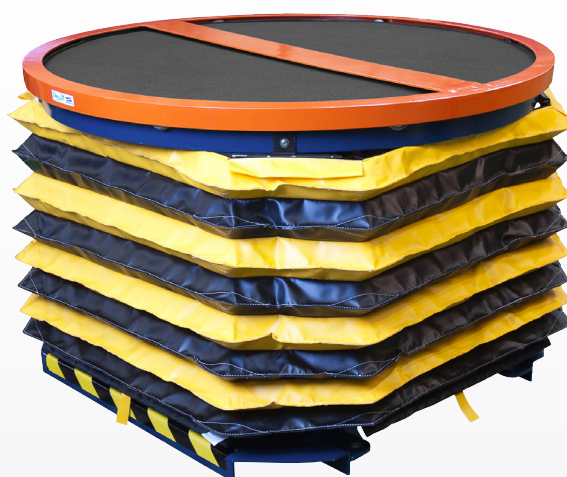
PL 2002 equipped with protective bellow