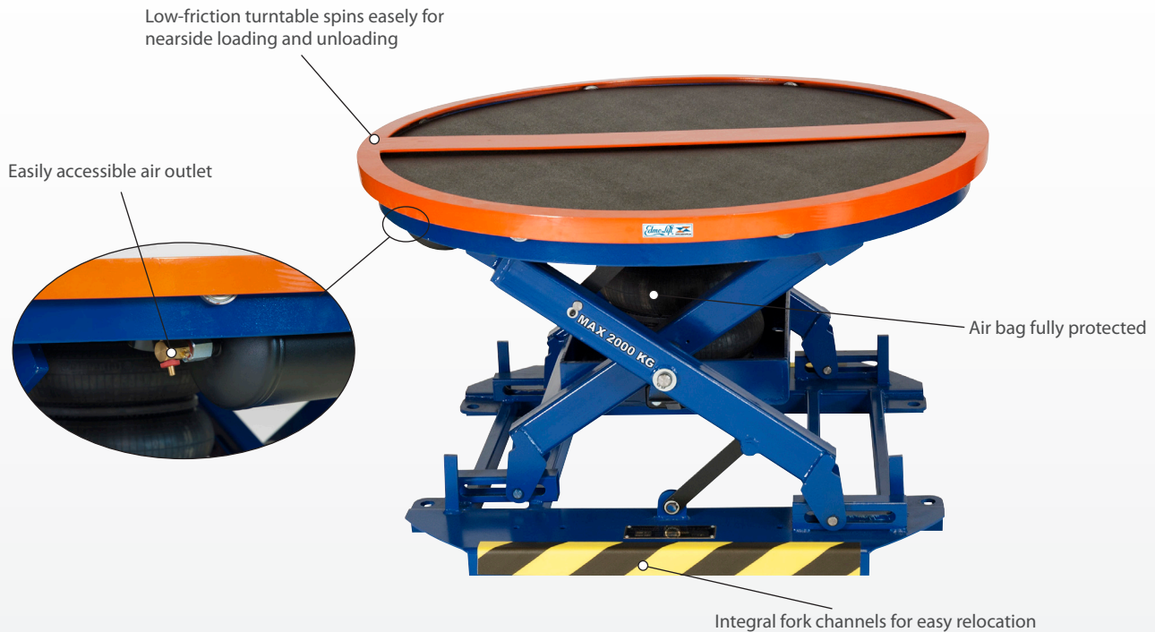
PL 2002 Full Access - 360°