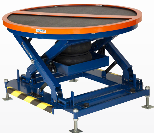
PL 2002 equipped with truck handling chassis